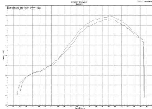
This graph shows a typical gain with a Dynojet jet kit.

Both stages may be used with a good aftermarket exhaust